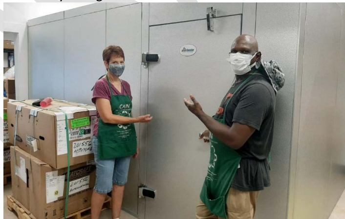
CAIN (Churches Active in Northside) staff show off the new refrigeration allowing them to rescue more food

Technical support includes promoting share tables at schools and providing scales and other technology needed for food rescue to a variety of organizations.