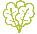
CUT LEAFY GREENS